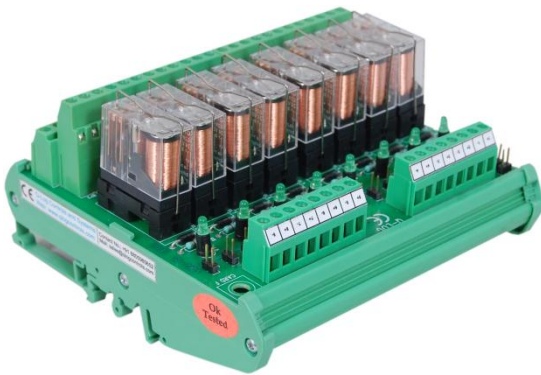
8 Relay board,24VDC,2CO,Positive Common